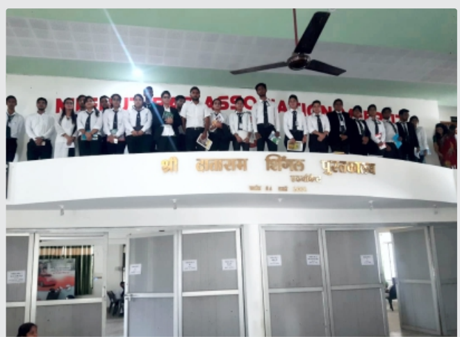
Visit to Shri Dataram Singhal Library