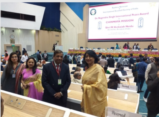
Visit to Dr. Nagendra Singh International Peace Award