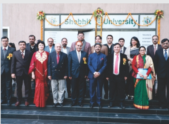
Guests Present along with Hon'ble Chancellor for Human Rights Programme 2019