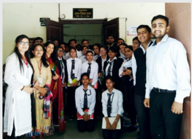
Visit to District Court, Meerut