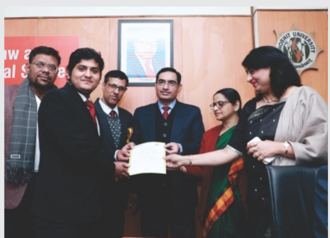
Certificate Distribution of Basic Training on Human Rights 2019