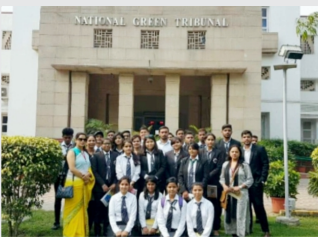
Visit to National Green Tribunal